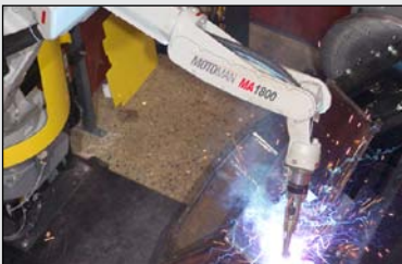
IMPROVED PART ACCESS